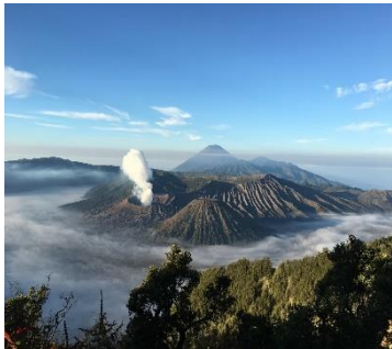
Hanny and Given both shared pictures of mountains and water from Indonesia: