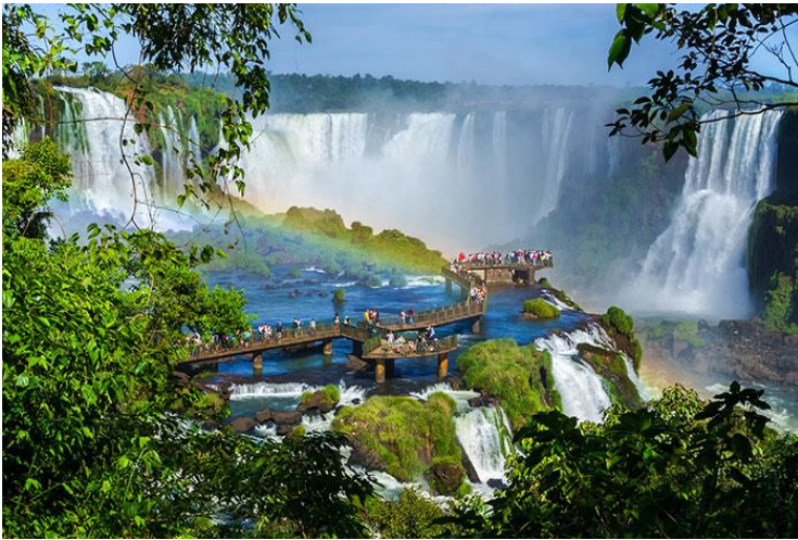
Dionisio from Brazil shared pictures of Iguazu Falls, in Southern Brazil, and Baio do Sancho, a beach in Northeast Brazil.